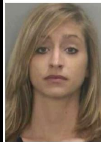
Aged 22 years