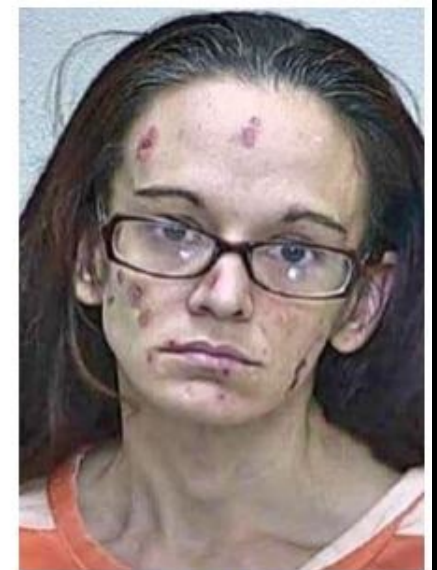
Aged 31 years

https://www.physio-pedia.com/Cellulitis#/media/File:Classic_celulitis.PNG