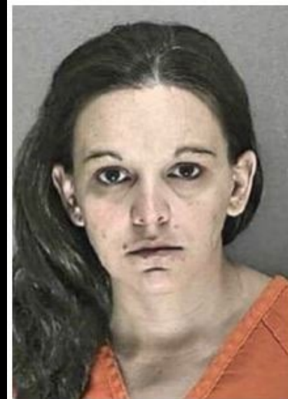
Aged 29 years