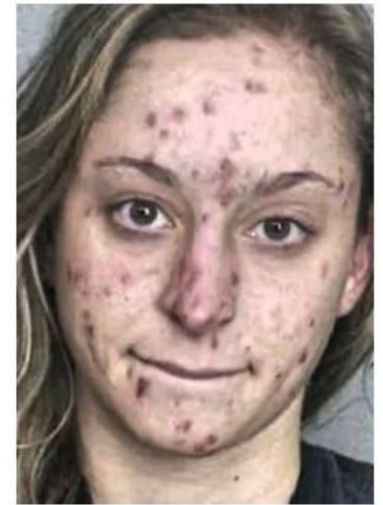
Aged 23 years